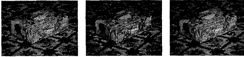
Figure 2: Video compression. Left: frame 1 of the box video sequence, Center: frame 1 of the synthesized sequence for a compression ratio of 575:1, Center: frame 1 of the synthesized sequence coded for a compression ratio of 317:1.